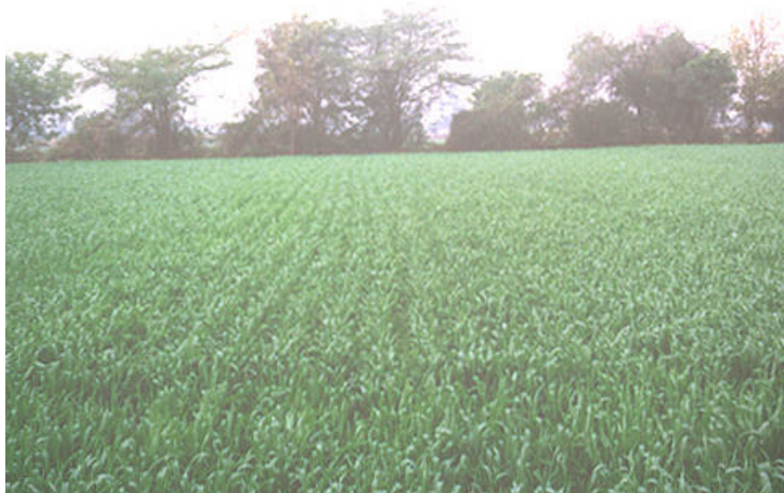
Wheat sown in a Farmer's field using Zero Till (Haryana, India): 1999-2000